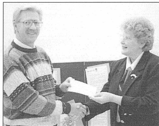
Presentation to Yellowknife Women's Centre

Contributions can be made to the general fund or in a separate fund in your name or the name of someone you wish to be remembered. Donations may qualify for deductions for Income Tax purposes.