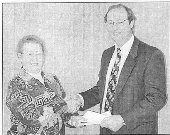
Presentation to The Yellowknife Senior Society

For further information, please contact any of Foundation's Board Members.